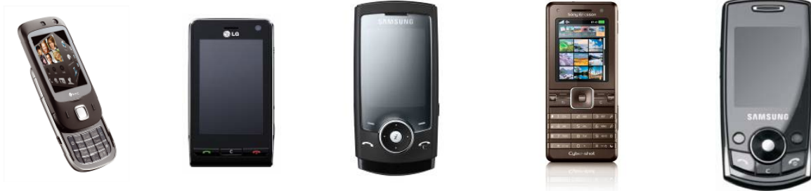
HTC Touch Dual

Sleek design, multimedia capabilities, touch screens... there's a Bouygues Telecom phone that's just right for each and every customer: