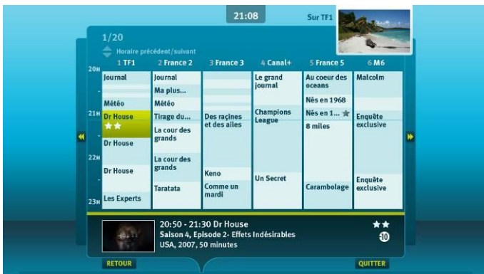
An entertainment programming guide (EPG) for easy programme search by scrolling through a grid, with one-click recording.

This interface is available for all Bbox customers—ADSL or fibre—and features: