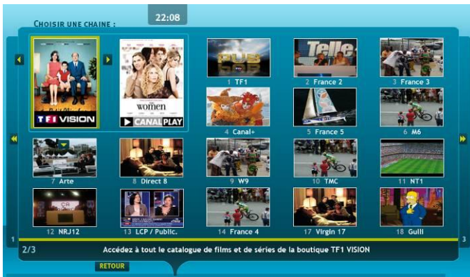
A mosaic of tiles for instant viewing of the top-tier channels from the Bbox offer.