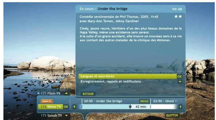
A channel surfing bar for instant display of programmes being shown on other channels.