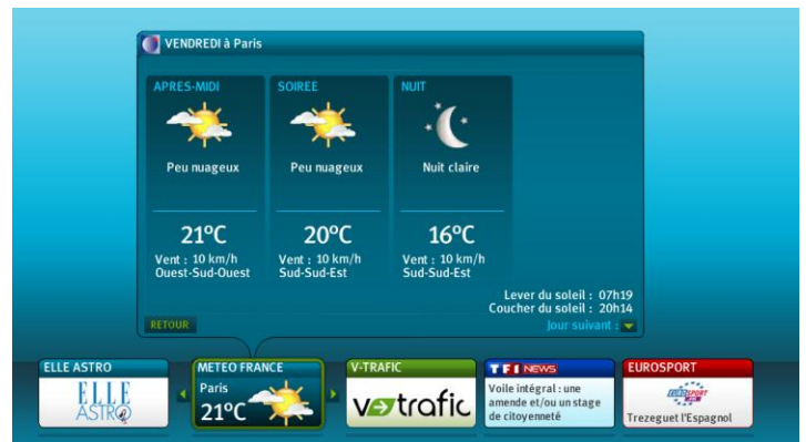
A multimedia service called "m@ TV", allowing all Bbox TV customers to instantly access Web content from their TV screen (Météo France, V-Trafic, Eurosport, Closer, Elle Astro, TF1 News and Boursier.com). The service will quickly expand with new applications.

Also, a soon-to-be launched media centre 5 will enable access to all multimedia content directly from the TV screen.